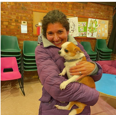
Louisa (as Elle) with Bisous (as Bruiser)