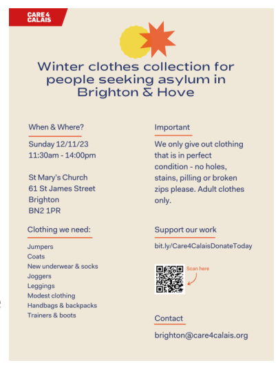
Care 4 Calais

Our volunteer group is currently supporting around 200 people living in hotels who are seeking asylum in Brighton and Eastbourne. We are still in need of winter clothes. We are hosting a collection for clothes at St Mary's Church, 61 St James Street, Kemptown, Brighton on Sunday 12th November. 11:30am - 2pm. We accept second-hand clothes in great condition or new clothes. Please give ONLY what is requested on the list. You can get in touch with us at brighton@care4calais.org if you have any questions.