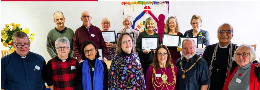
Home > About us > News > News releases > All News > Brinton and Howe first Methodist churches to become Churches of Sanctuary

We're up on the Methodist Church website again—this time as the first Circuit in the UK to achieve Sanctuary status. Full story at: https://www.methodist.org.uk/about-us/news/latest-news/